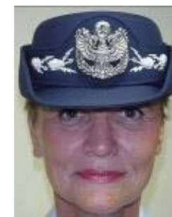
Women's Field Grade Service Cap