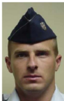
Senior Member Officer Flight Cap