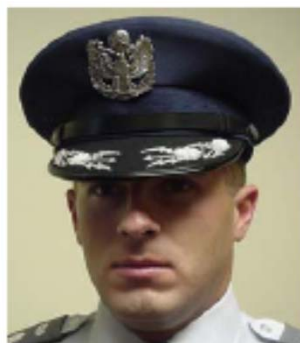
Senior Member Field Grade Service Cap